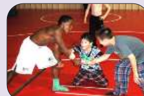
They can't get enough