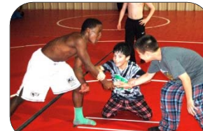
They can't get enough